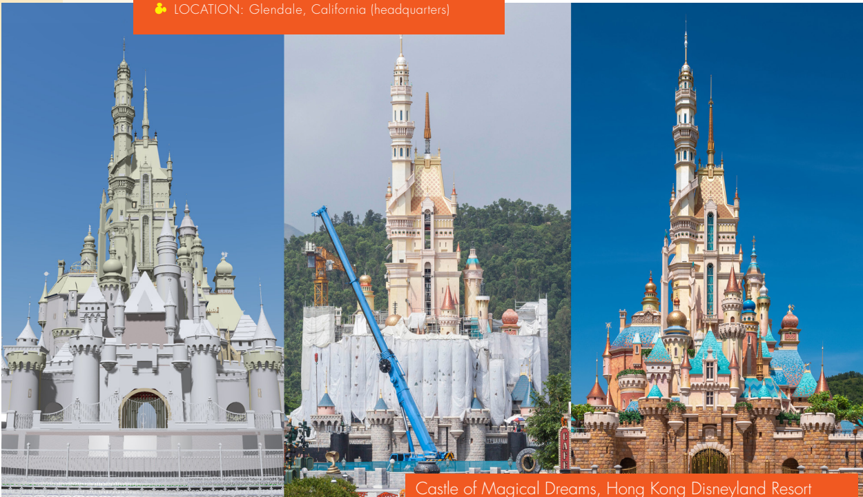
Castle of Magical Dreams, Hong Kong Disneyland Resort